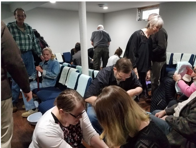
Top and Bottom are the first communion held at Wautoma Company

One day, Jesus asked his Disciples, "Who do you say that I, the Son of Man am?" Some days, Jesus was a great "this" or a great "that." He was a mere man, or He wasn't a mere man. He truly was a great teacher. And a great prophet. He was the greatest moral person that ever lived. Jesus was the greatest Teacher the world has ever known. The greatest Preacher the world has ever heard, But He was so much more! He is a friend to the friendless; (continued below)